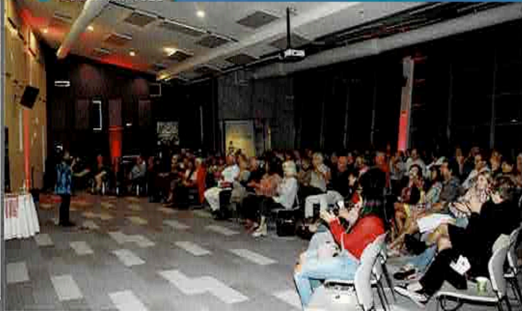
Delivering her Love, Laughter and Light show to a sold out Wetmore GM audience