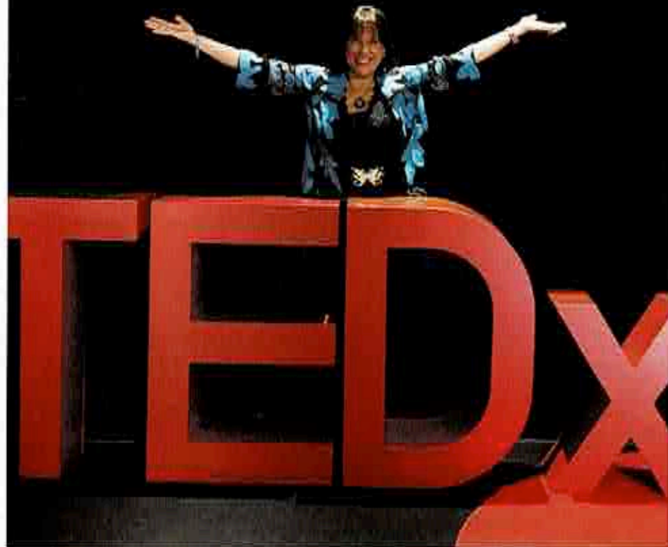
Photo taken after breaking the world record for reciting back her entire TEDx talk in less than 1 minute